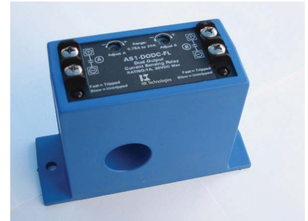
AC Current Operated Switch With Dual Output