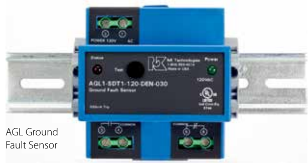
AGL Ground Fault Sensor