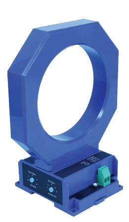
CONDUCTORS UP TO 0.75" DIAMETER